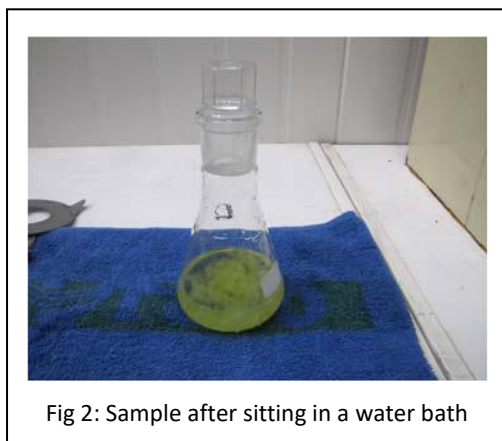
Fig 2: Sample after sitting in a water bath