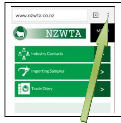
3-Dot menu button

At the top right of the screen (next to the address bar), look for and tap the 3-Dot menu button (shown right). Depending on the make or model of phone, there will be options like "Add to home screen", "Add shortcut to home" or "Bookmark". Tap that option and an icon of the NZWTA Ltd logo will instantly appear in the nearest available space in your desktop / home screen. This shortcut will take you to the page that it is linked to.