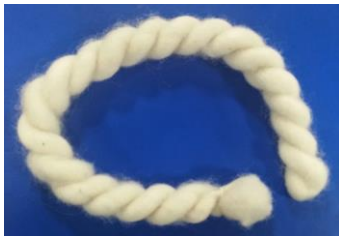
Fig 1: A twisted hank

The test procedure has been developed into a New Zealand Standard (NZS 8719). Throughout the entire scouring process three LAC test samples are randomly drawn using specially-designed sampling equipment. One of the three samples is randomly selected as the test sample.