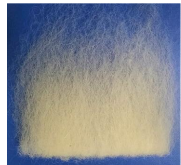
Fig 2: A sample ready for measurement